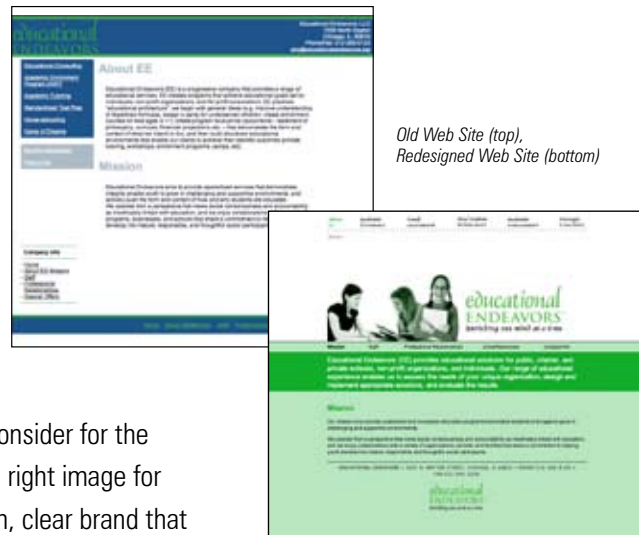
Old Web Site (top), Redesigned Web Site (bottom)

Endeavors, Visible Logic provided a preliminary branding consultation—an important step often missed when determining an overall design. This helped reveal Educational Endeavors’ business goals and overall mission. Educational Endeavors was struggling—and continues to struggle—with differentiation, but Visible Logic helped them with this challenge. After the initial consultation, designers provided logo samples, images to consider for the web site, and other visuals to help identify the right image for Educational Endeavors. “We went with a clean, clear brand that relied on name, not image, recognition. We weren’t able to nail this down until Visible Logic came into the picture,” says Davis.